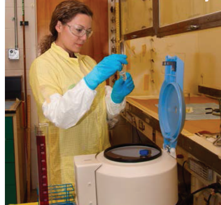
Learn about nuclear forensics